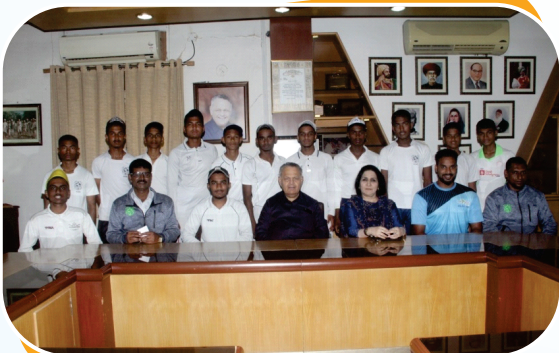
Anglo Urdu Boys High School & Junior College won 9 th Maharashtra State Level Montexball Cricket Championship held at Nashik from 28 th to 30 th December 2019.

Abeda Inamdar Senior College Team secured 1 st place in 26 th Senior Softball State Level Championship held at Chalisgoan from 7 th to 10 th February 2020.