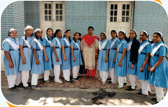
Anglo Urdu Girls' High School Lifted Runners Up title in Z. P. Inter School Under 17 Nehru Hockey Girls Championship 2019 held at Polly Grass Ground, Pimpri, Pune dated 12 th September 2019.

Abeda Inamdar Junior College for Girls won Z. P. Inter District, Divisional Level Rugby Competition held at Ahmednagar on 2 nd November 2019 & participated in State Level Rugby Championship held at Kasara from 4 th to 7 th November 2019.