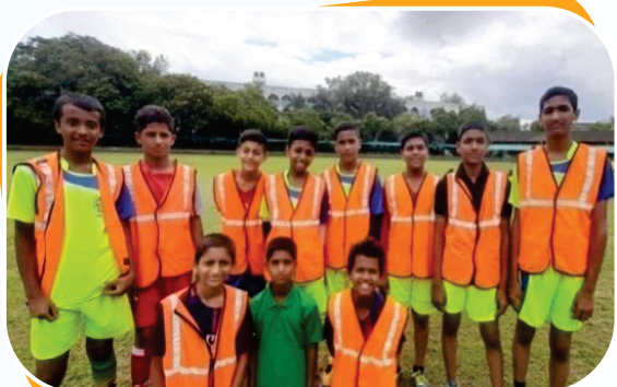
Under 14 Boys Team

Anglo Urdu Boys' High School and Junior College won Z. P. Inter School Under 14, 17 & 19 boys Rugby Competition 2019 on 27 th & 28 th September 2019.