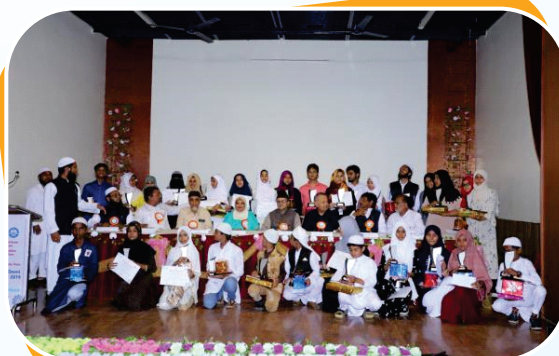
Winning students with the Chief Guest and other Dignitaries