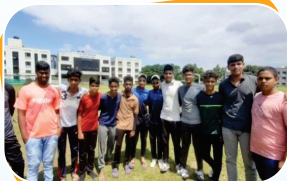
Under 19 Boys Team