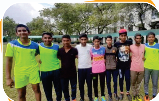
Under 17 Boys Team