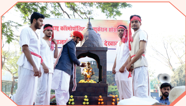
Chatrapati Shivaji Maharaj Jayanti Rally 19/2/2019