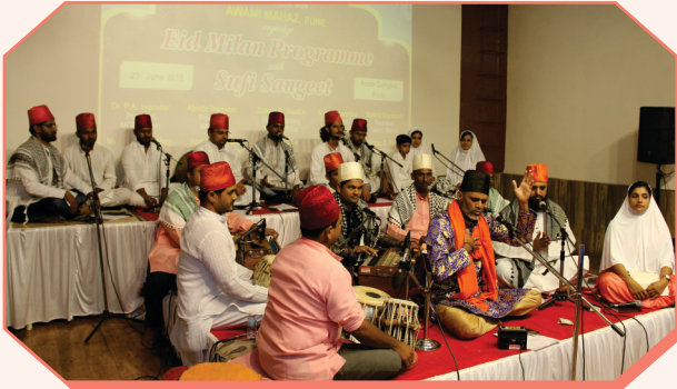
Eid Milan Function 23/6/2018