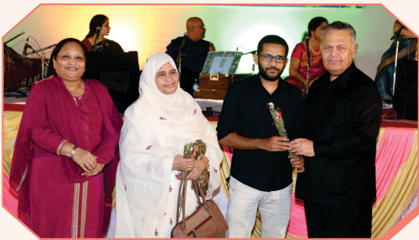
MCES Foundation Day 28/11/2018