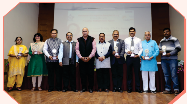
'Dr. P. A. Inamdar Award' presentation 28/12/2018