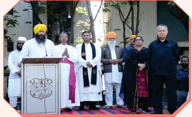
Condolence to Shaheed Jawans 20/2/2019