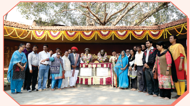
Mahatma Jyotiba Phule Rally 28/11/2018