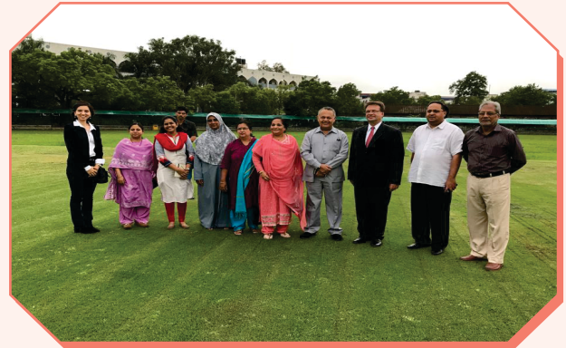
American Federation 13/8/2018