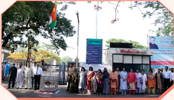
Maharashtra Day 1/5/2018