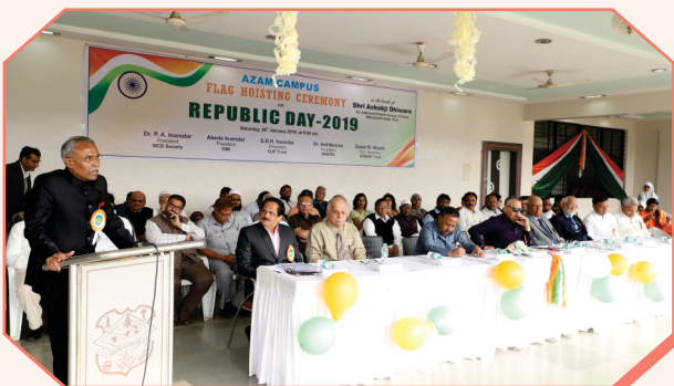
Republic Day 26/1/2019