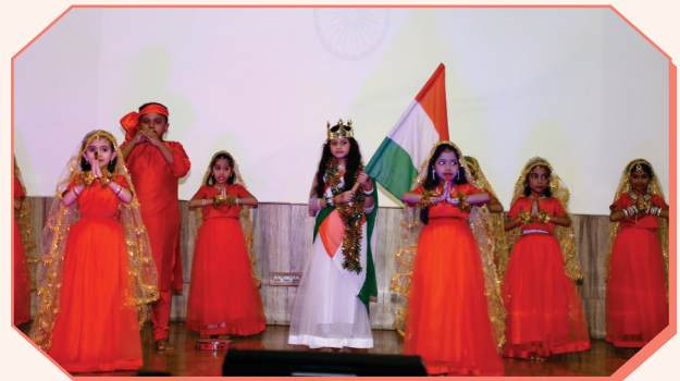
Independence Day 15/8/2018