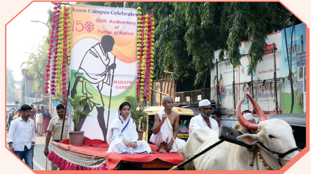
Mahatma Gandhi Jayanti Rally 2/10/2018