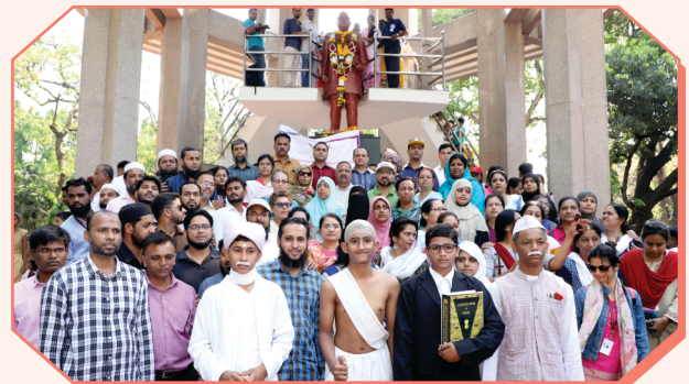
Dr. Babasaheb Ambedkar Jayanti Rally 14/4/2019