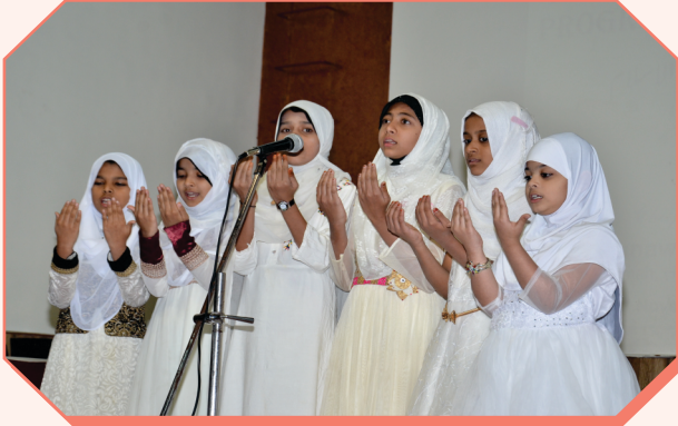
Annual Programme of Madras-e-Talimul Islam 22/1/2019