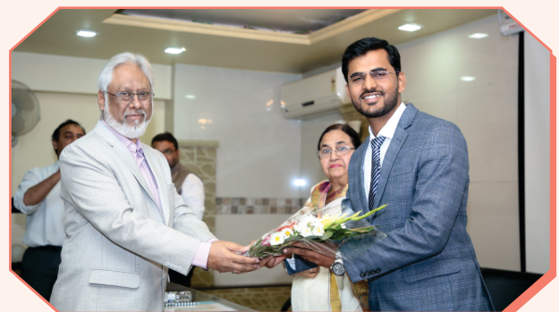
Professional Scholarship Distribution 26/1/2019