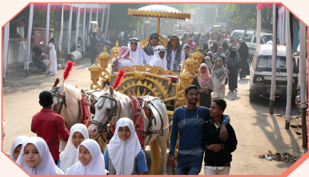
Eid-e-Milad Rally 21/11/2018