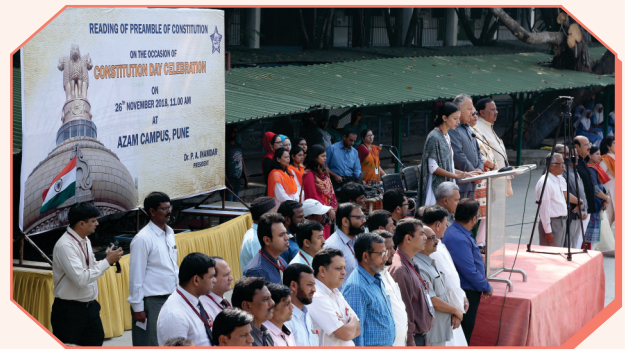
Constitution Day 11/12/2018