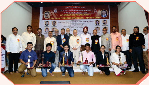
Felicitation SSC Meritorious Students 13/8/2018