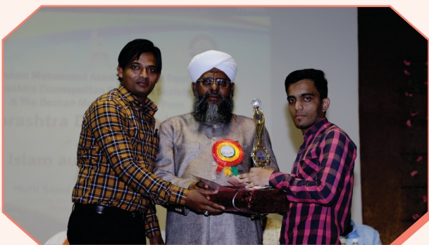
All Maharashtra Elocution Competition 22/12 /18